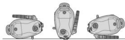
Three directions horizontal storage